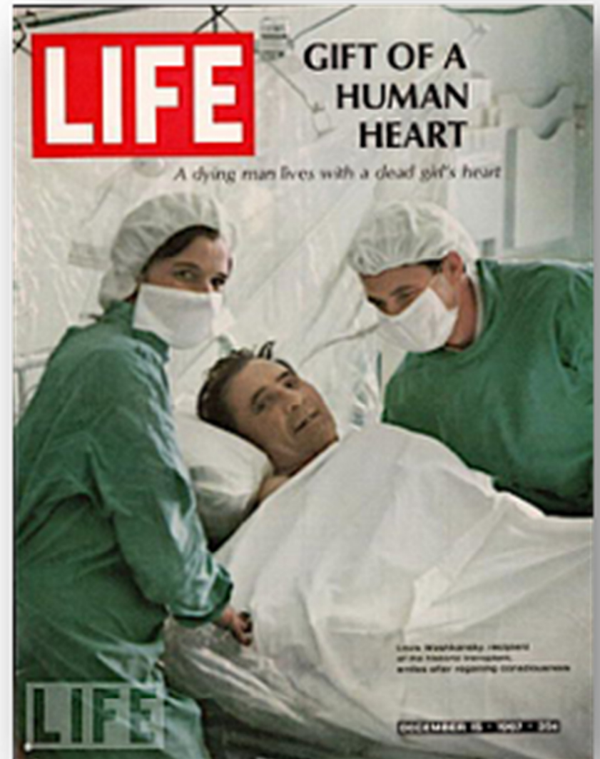
December 1967 CapeTown Groote Schuur Hospital Christian Barnard